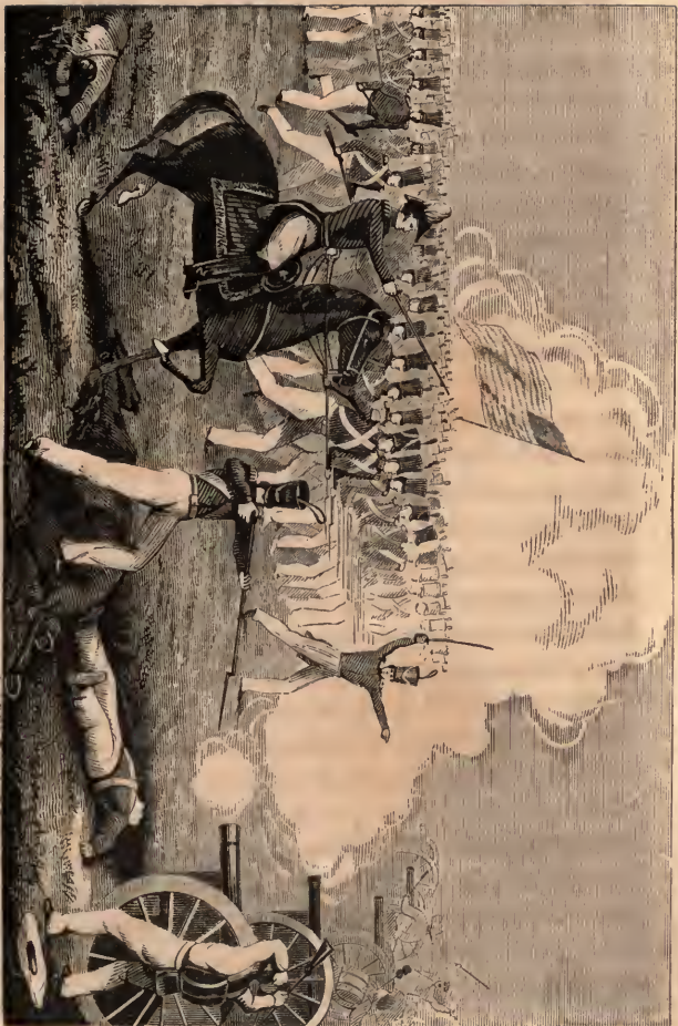
GENERAL TAYLOR AT THE BATTLE OF PALO ALTO.